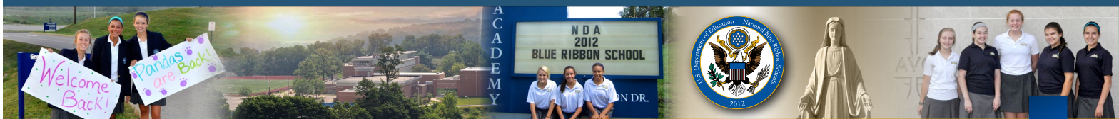
An e-Newsletter for the Families of Notre Dame Academy